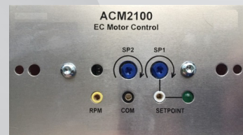
Multi-Speed Controller (iQ-MS)

For more information, contact your local sales representative or visit our website at www.pennbarry.com