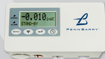
Intelligent Pressure Control Module (iQ-IPCM)